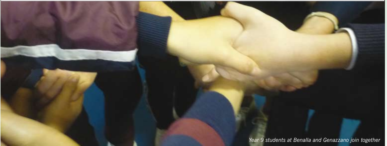
Year 9 students at Benalla and Genazzano join together

The students made many new friends and had to bid a sad farewell as the Benalla students departed for home. The thought on many students' minds seemed to be, if only we could do it again.