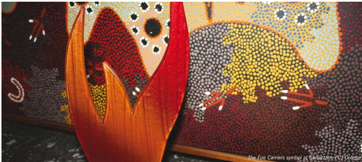
The Fire Carriers symbol at Genazzano FCJ College

At each assembly at Genazzano FCJ College the gathered school community acknowledges the land on which the Wurundjeri people are the original custodians. Throughout the curriculum, in liturgical celebrations and particularly with the Year 10 Kimberley Exchange program, Genazzano students are reminded that all inhabitants share a love of this land and a wish to live in harmony and understanding. The students learn about the sacred tie of 'country', which is earthed in each Indigenous soul. They learn that the Indigenous connection to land, as hearth and home, is central to identity.